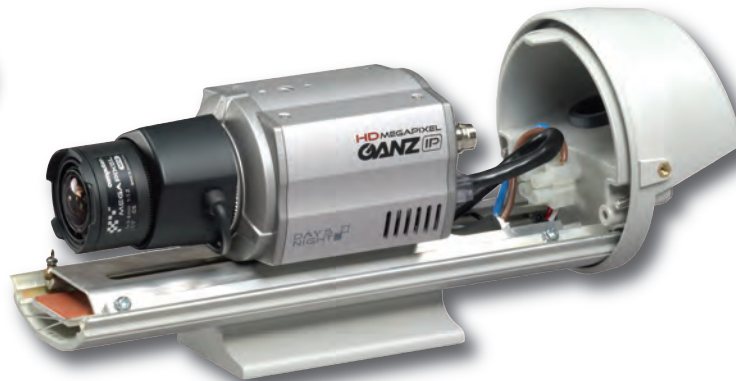
iPak inside view