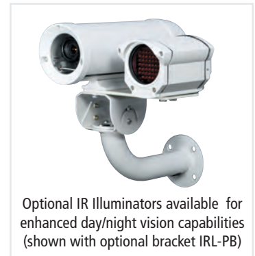
Optional IR Illuminators available for enhanced day/night vision capabilities (shown with optional bracket IRL-PB)